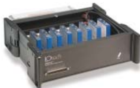
DBK42 with installed 5B modules