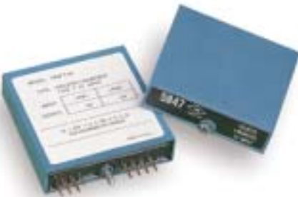
5B modules (see p. 184 for the complete 5B Module Selection Guide)