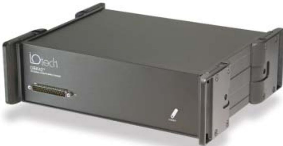
The DBK42 accommodates up to sixteen 5B signal conditioning modules

Configurability. The DBK42 offers exceptionally wide ranging configurability. For instance, it permits you to individually select the type of signal attached to every channel. Also, there is no limit to the type and combination of signals that can be attached to the DBK42.