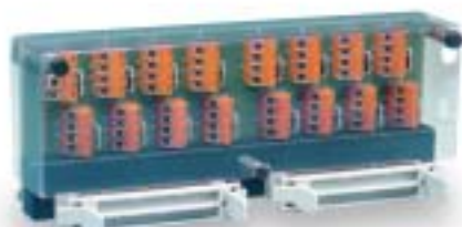
The CN-72 sixteen-channel screw terminal connection box with cold junction sensors